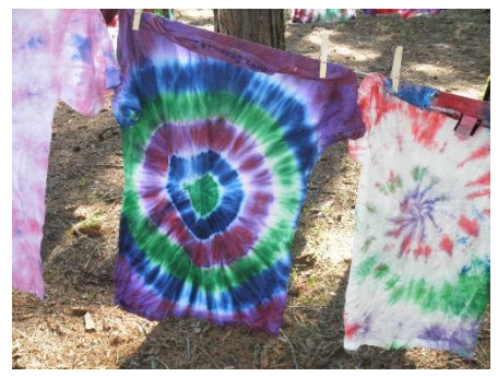
Tie Dye in Arts & Crafts